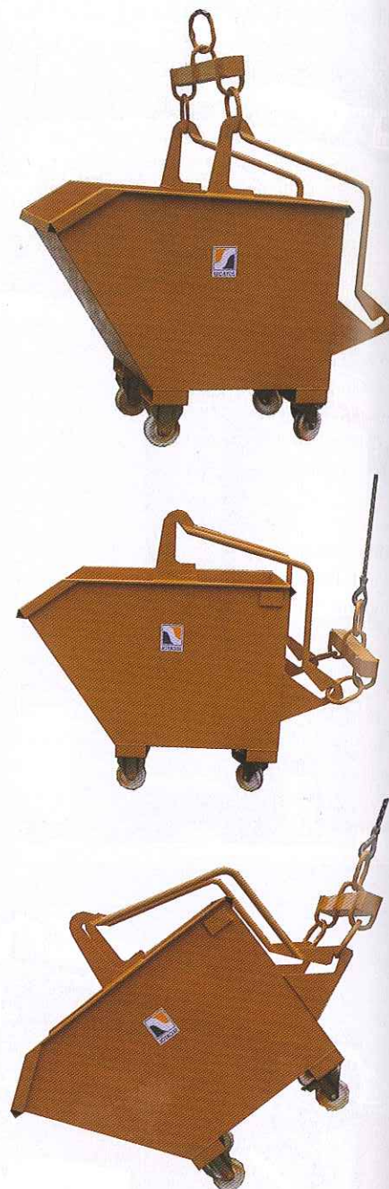
New PP75 skip

The new PP75 skip was designed to sort out and evacuate the waste on the jobsite or inside factories; its low width enables the skip to run through doors. Fitted with wheels, the skip can be handled everywhere. The system enables the operator to make handlings all by himself, without the help of a person on the ground.